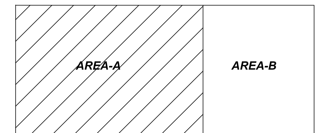
AREA KEY PLAN REF: S1.01 (DT.06/08/22) SCALE: 1/2" = 1'-0"